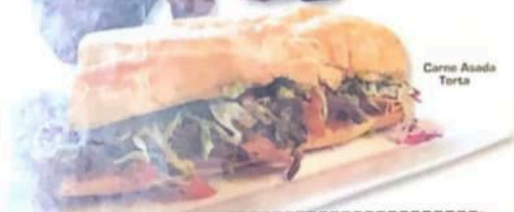
Carne Asada Torta