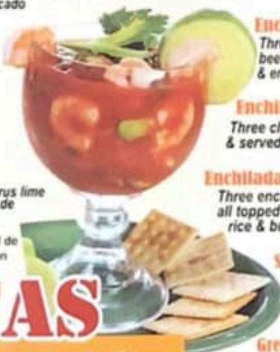
Cocktail de Camaron

Shrimp or fish ceviche marinated in citrus lime juice fill pulled cook mixed with a pico de gallo and avocado slices