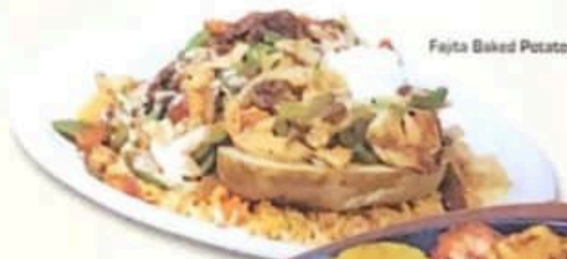
Fajita Baked Potato