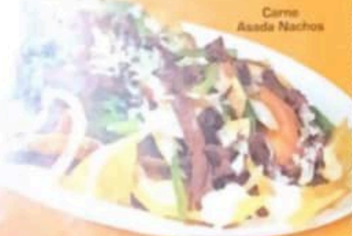
Carne Asada Nachos

Cheese nachos, assorted toppings of seasoned ground beef, shredded chicken & beans, covered lettuce, tomatoes & sour cream