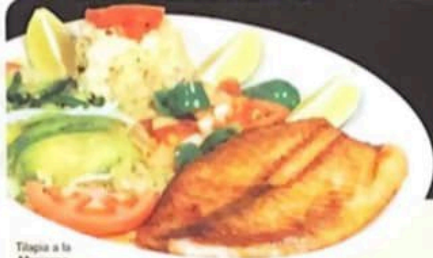
Tilapia a la Mexicana